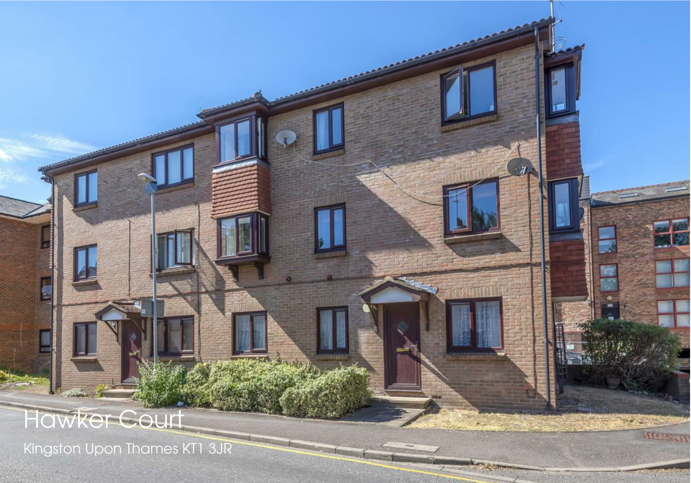
Hawker Court Kingston Upon Thames KT1 3JR